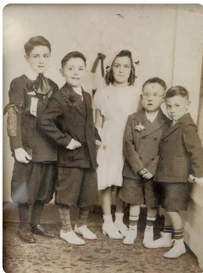
The Longo children circa 1940